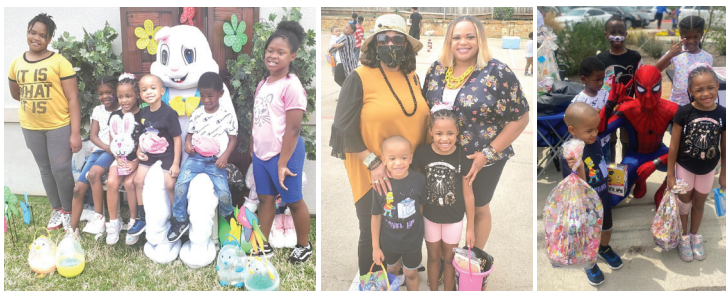
Pic 1 & 2) At Great Commission Baptist Church Easter Egg Event with Youth. Pic 3) At Como Community Center Easter Event with Youth.

Special Mother's Day Event: Mother's Day Love To You: Sunday May 1, 2022 at 11:30am Village Creek Wellness and Rehabilitation Center with Special Gifts for Mothers.